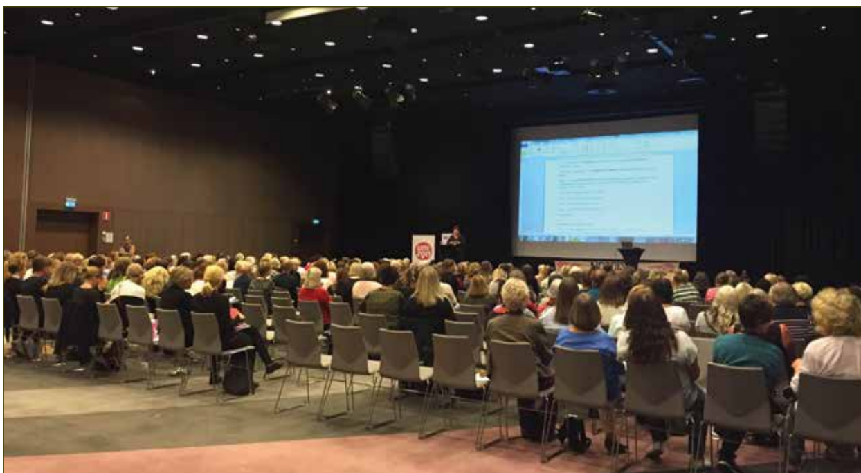
Sexualisering av det offentliga rummet/Sexualization of the Public Sphere Conference (Stockholm, Sweden)