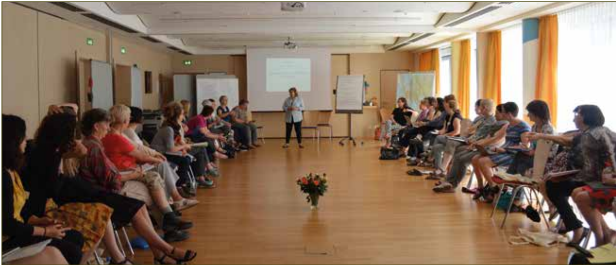
Meeting of the Advisory Board of Country Coordinators, CoCo (Vienna, Austria)

strengthening network activities (presented by the network Members from Poland, Russia, Malta, Romania, Turkey, and the Netherlands). Participants also were involved in workshops on issues ranging from WAVE campaigning on the implementation of the Istanbul Convention in Europe, to strengthening network communication and cooperation, and discussing new perspectives and innovative work in the field of combating violence against women.